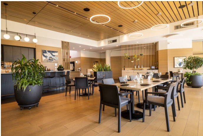
TABLE NINETEEN BAR ROOM